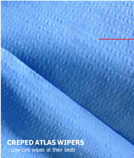
CREPED ATLAS WIPERS